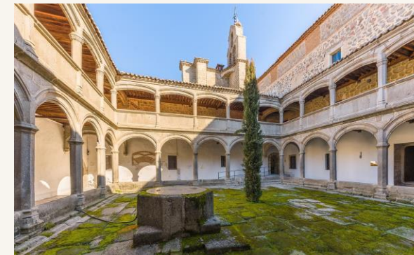
Royal Monastery of St. Thomas

This monastery has been through plenty of ups and downs: it was sacked during the French invasion, abandoned after the Confiscation of Mendizábal and damaged by fires in 1699 and 1936.