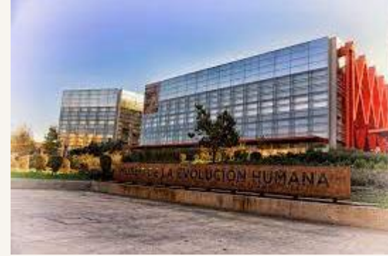
Museum of Human Evolution

Holder of numerous architecture prizes. The museum features discoveries made in Atapuerca, and conserves the remains found there.