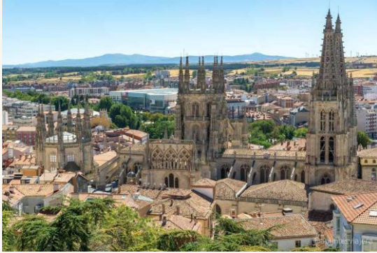
Cathedral of Saint Mary

The only cathedral in Spain to have been declared a UNESCO World Heritage Site in itself.