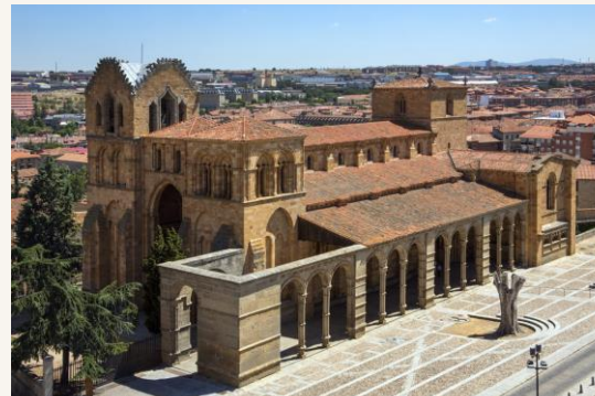
Basilica of San Vicente

A notable example of Romanesque architecture. For centuries, the Basilica has been renowned as a religious and artistic symbol of the Castile region.