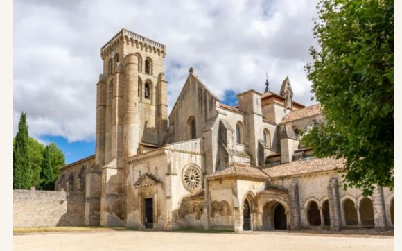
Monastery of Las Huelgas

Founded in 1187 at the behest of King Alfonso VIII and his wife Leonor. He planned to use it as a royal mausoleum. Its exterior has a striking Romanesque profile, while inside there is a surprising mix of styles.