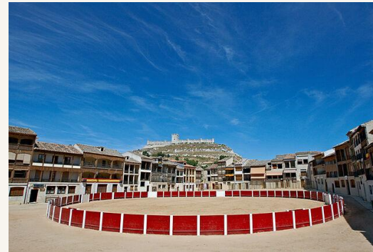
Plaza del Coso

www.museosdelvino.es/museos/museo-provincial-del-vino-de-valladolid/