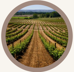
Ribera del Duero