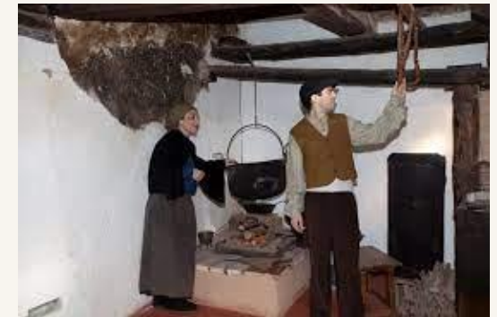
La Ribera House-Museum

Declared a Site of Cultural Interest in 1999. This public space was built in the Middle Ages to host bullfighting events, and it retains that function to this day.