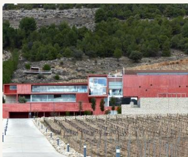
PAGO DE CARRAOVEJAS www.pagodecarraovejas.com