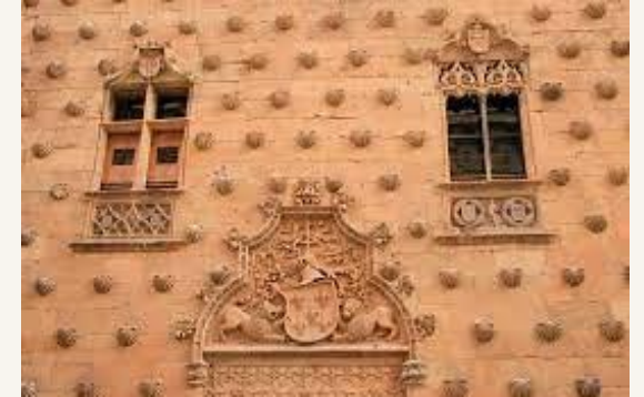
Casa de las Conchas

Opening times: Monday to Sunday: 10am to 6pm (last entry: 5:15pm)