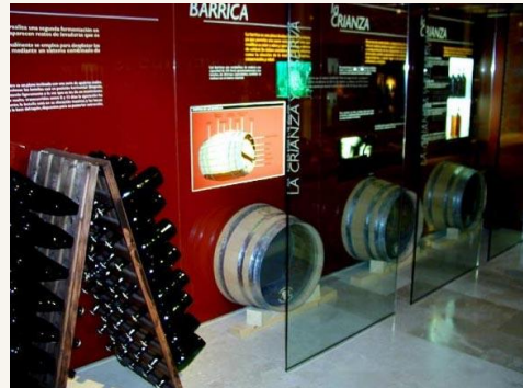
Provincial Wine Museum

Located inside the castle. Guests are taken on a journey through the history and culture of wine, where they can learn all about winemaking.