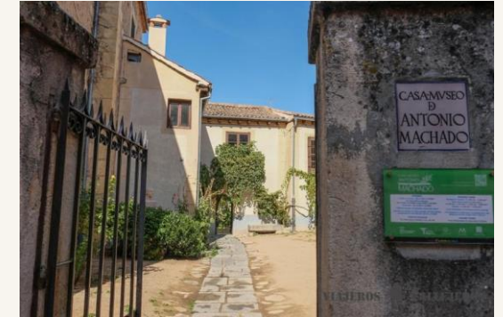
Antonio Machado House-Museum

In 1919, the poet Machado came to Segovia to take up a professorship at a school. He lived in a room in this house.